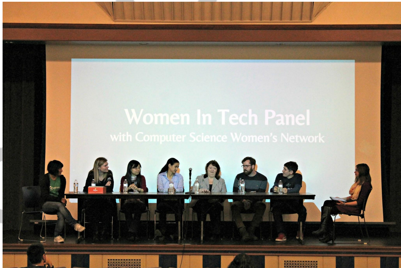
Women in Tech Panel